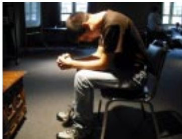
Pictures can say a thousand words, so we're letting these shots tell their own story. From sports to dances to annual events, these pictures have all been taken in the past month!