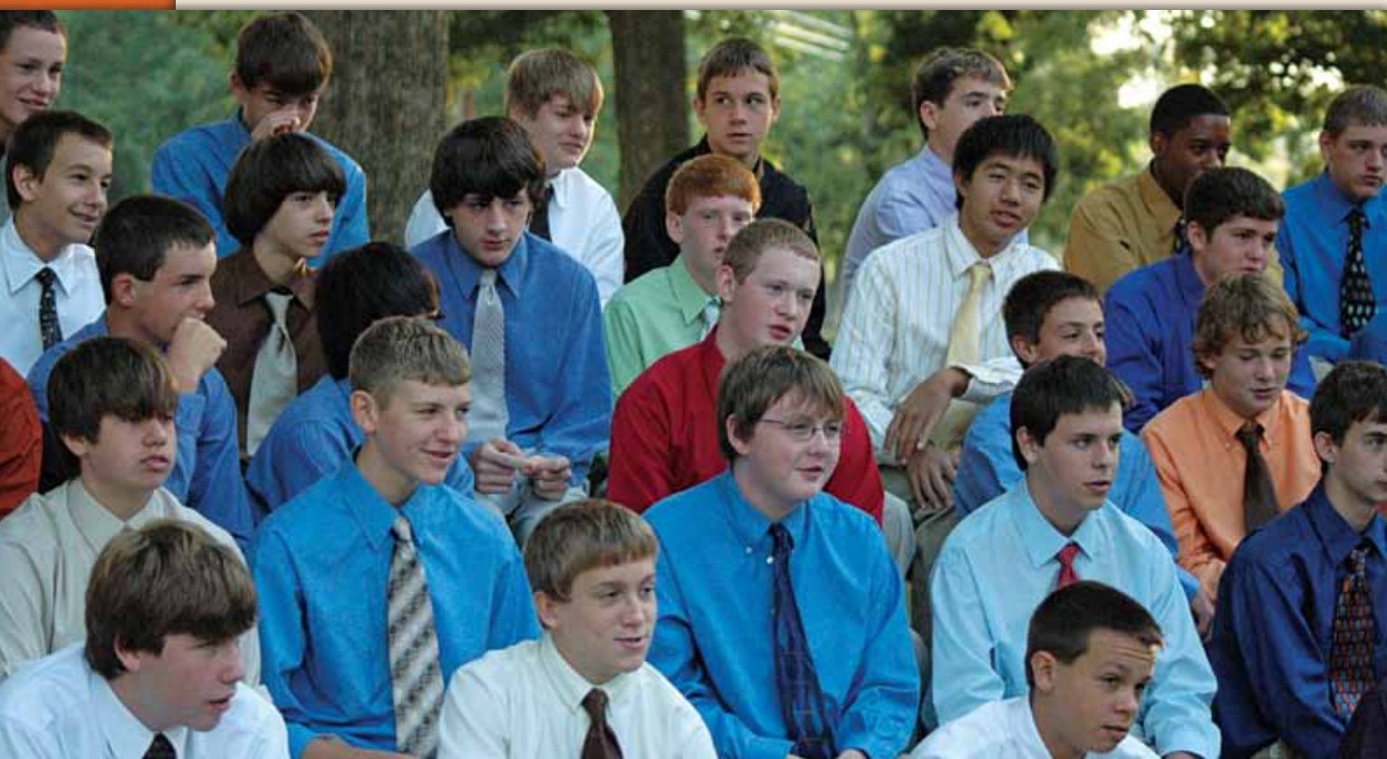
2009 Freshmen Orientation